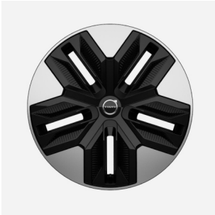
18" 5 Spoke Aero