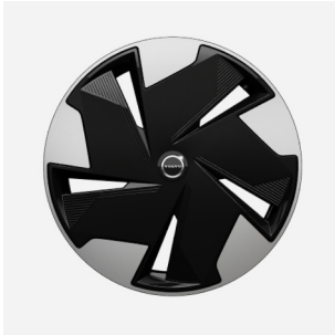
19" 5 Spoke Aero