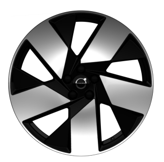
20" 5 Spoke (#1185)