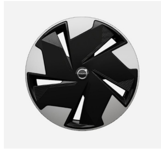
19" 5 Spoke