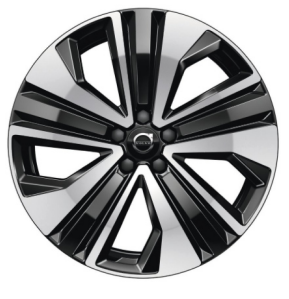
18" 5 Multi Spoke (std Core)